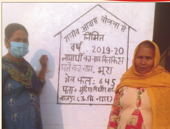
Number of people benefitted from government schemes

Suchetna encourages beneficiaries to know about their eligibility and Government Schemes and avail benefits for the people in the remote areas. With our intervention and assistance the following Government Schemes were implemented in various target areas.